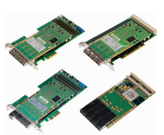
TTENetwork Interface Cards

TTTech Aerospace provided TTEthernet® chip IP, software, scheduling tools and various TTEthernet® equipment for ground-based development and test purposes (switches with and without monitoring capability and interface cards in different form factors).